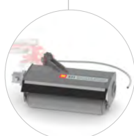
XTI Tiny Flail Mulcher