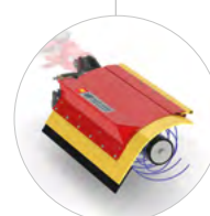
XDF Weed Brush