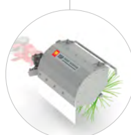
XSP Shoot Remover