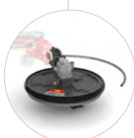
XSC Outrigger Mower