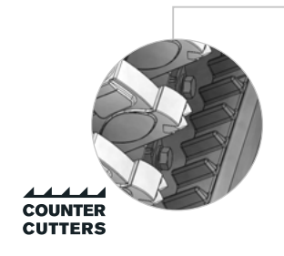
Counter cutters inside the chassis for a perfect mulching result